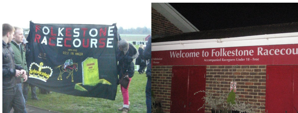
Pictured previous page top - the parade ring and fishpond and below the grandstand on the final.

As the sun set over the giant screen on the course, the scenes in the winner's enclosure were as so many times before. But we all knew, the like wouldn't be seen again.