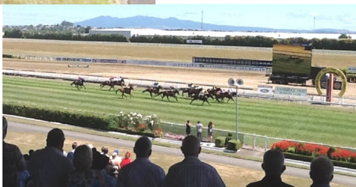
Right - The finish of race 4

The top NZ jockey was Opie Bosson with a 25% strike rate. He won a group 1 race and raced at all of the other tracks we visited, winning at least 2 races at each track.