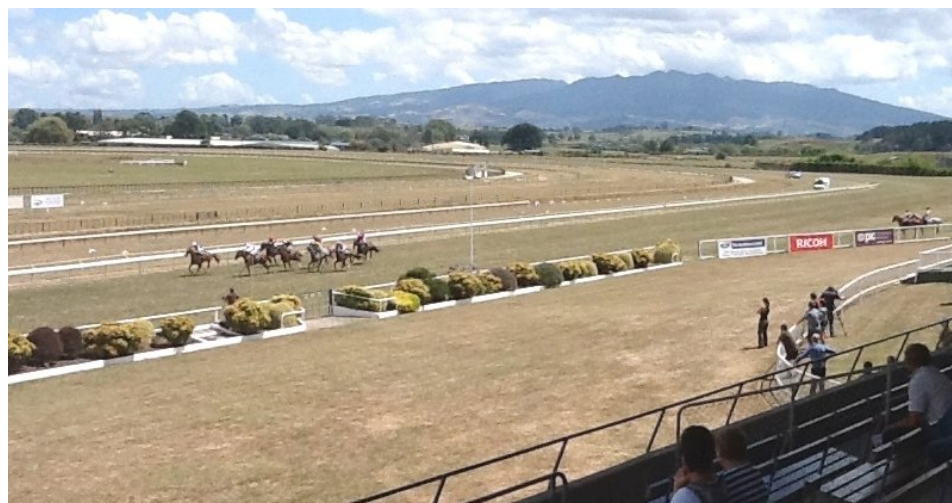
The view of racing at Te Awamutu from the stands.